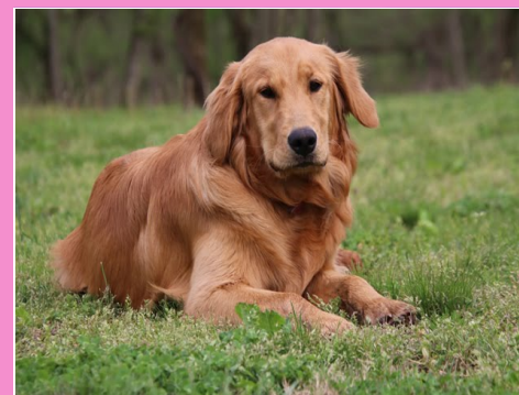
Makita (Poodle Standard)