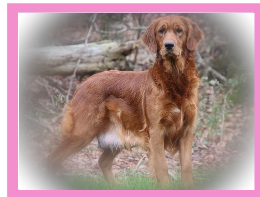
Katie (Golden Retriever)